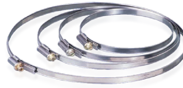
C - series

The clamps are designed for quick and reliable mounting and connection of various round ventilation system components. The clamps facilitate the installation and removal of fans for maintenance and cleaning.