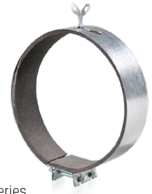
CZ - series